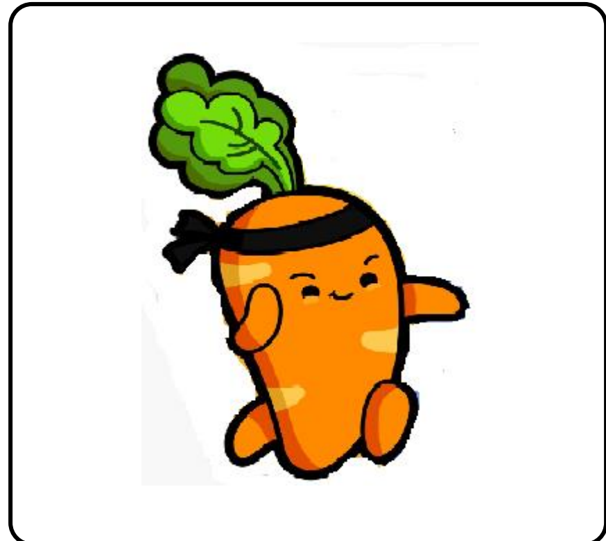
Karate Carrot by night!