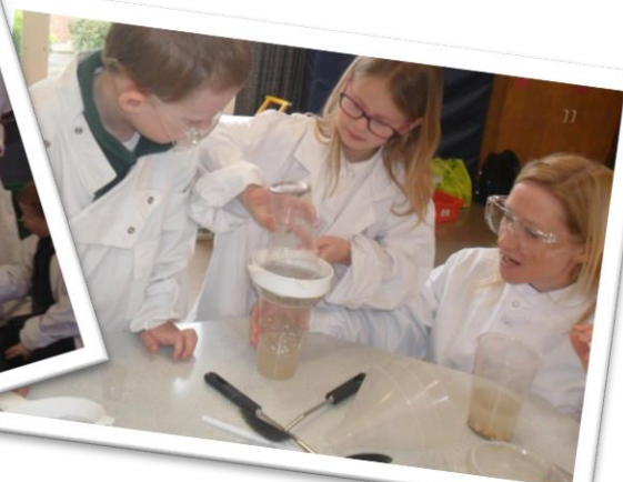
Science in action this week!