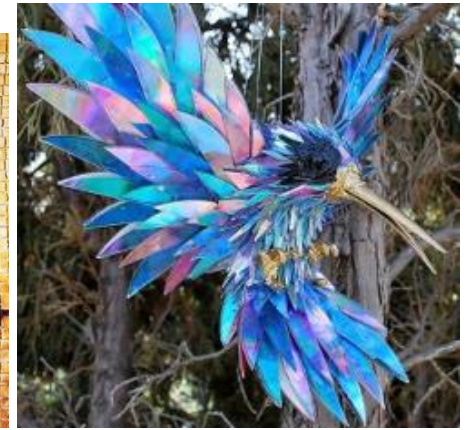
A bird made from old CDs