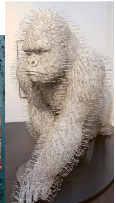
A gorilla made out of coat hangers!