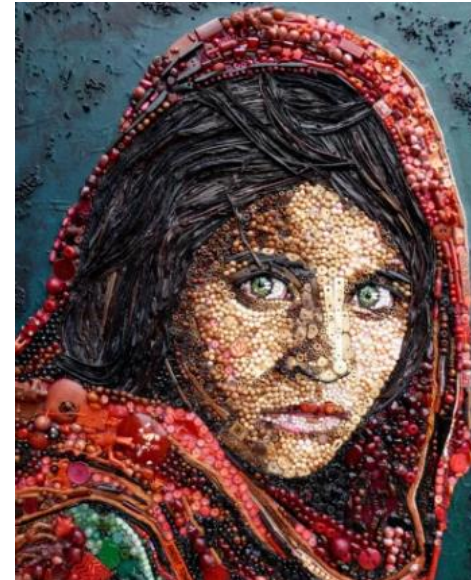
A portrait made from beads