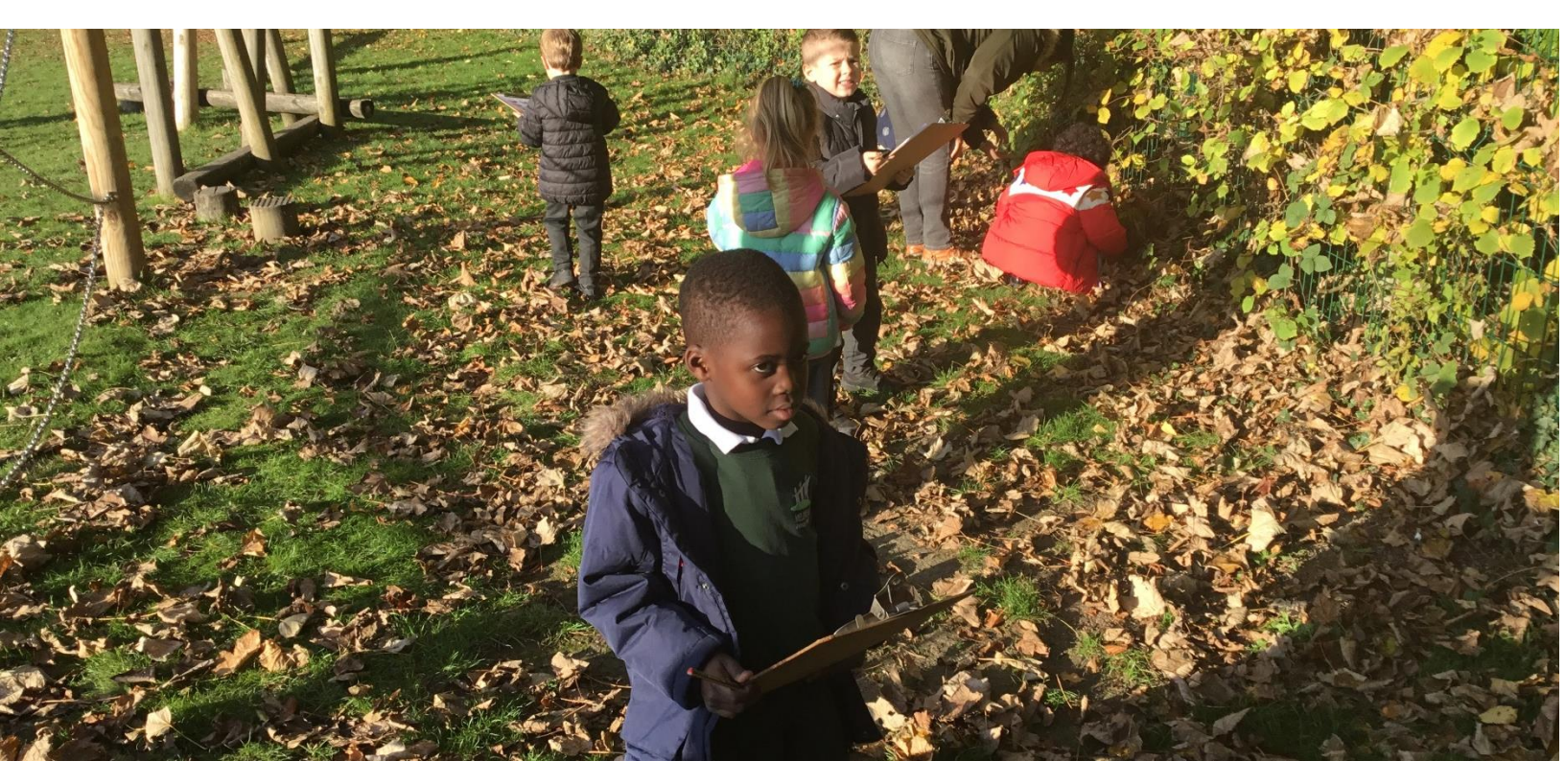
Swift Class Autumn Spotting

Get ready everyone for our Nativity 'Children of the World' on Wednesday and Thursday next week! Come along and enjoy our Christmas musical about the different festive customs around the world. Tickets are now available to book on MCAS.