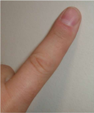
Length of your finger