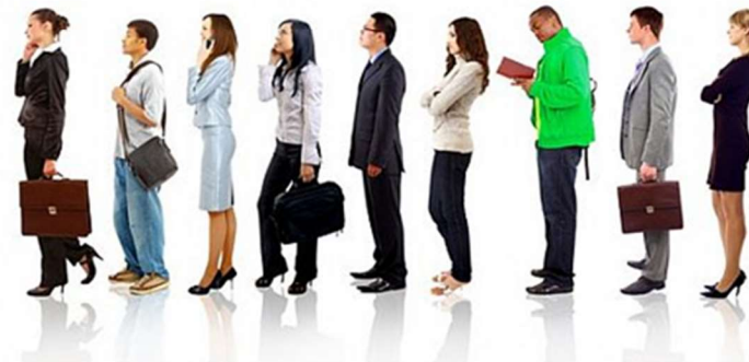
Length of a queue