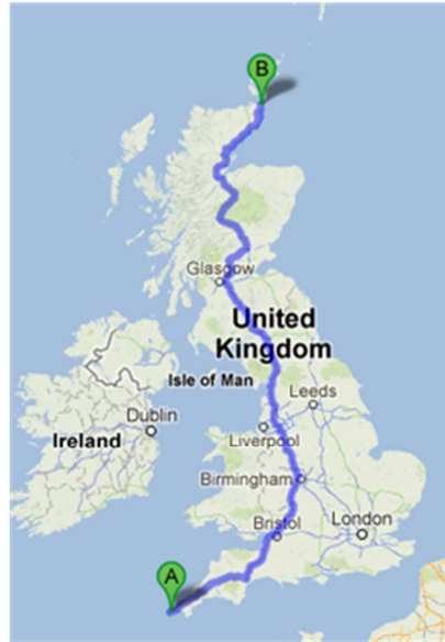
Distance from Lands End to John o'Groats