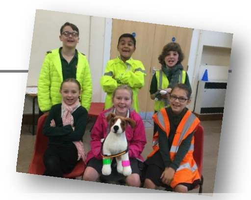
Our Junior Travel Ambassadors presenting their Road Safety Assembly this week.