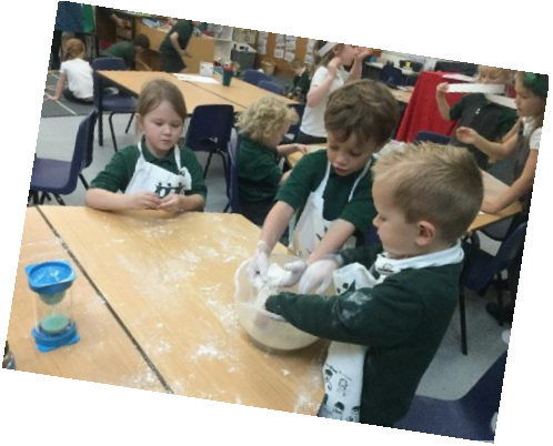
Robin Class have been very busy learning in their Yummy Scrummy topic recently. And are looking forward to feeding parents at their Parent Café today!